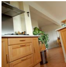
KITCHEN AND BATHROOM